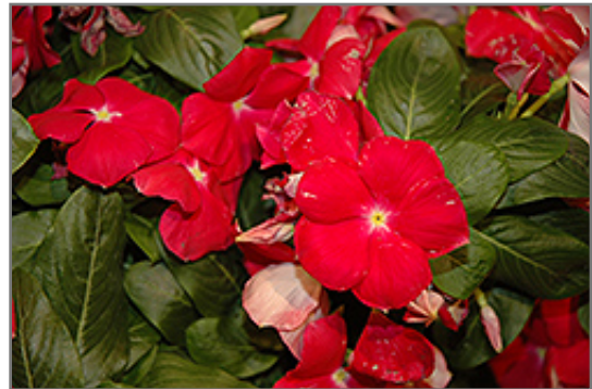
Cora Cascade Cherry Vinca flowers