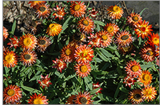
Sundaze Blaze Strawflower flowers