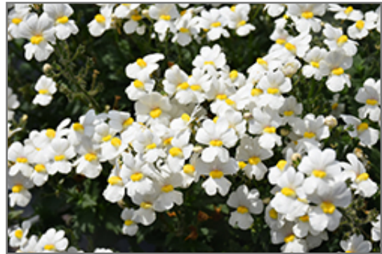
Sunsatia Coconut Nemesia flowers