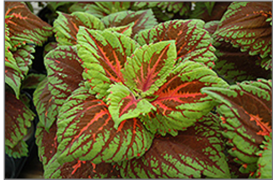
Kong Salmon Pink Coleus foliage