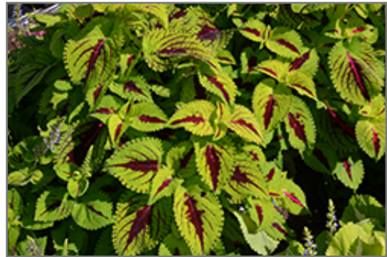
Kong Jr. Lime Vein Coleus foliage