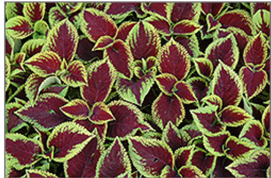
Kong Jr. Scarlet Coleus foliage

Kong Jr. Scarlet Coleus will grow to be about 24 inches tall at maturity, with a spread of 30 inches. When grown in masses or used as a bedding plant, individual plants should be spaced approximately 24 inches apart. Although it's not a true annual, this fast-growing plant can be expected to behave as an annual in our climate if left outdoors over the winter, usually needing replacement the following year. As such, gardeners should take into consideration that it will perform differently than it would in its native habitat.