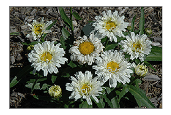
Freak! Shasta Daisy flowers

905-945-2219 1-800-461-7374 www.colesflorist.ca