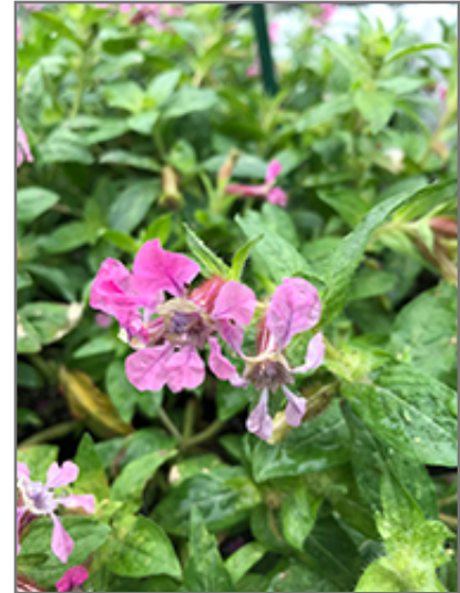
Sriracha Pink Cuphea flowers