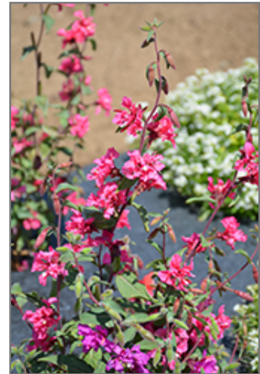
Sriracha Rose Cuphea flowers