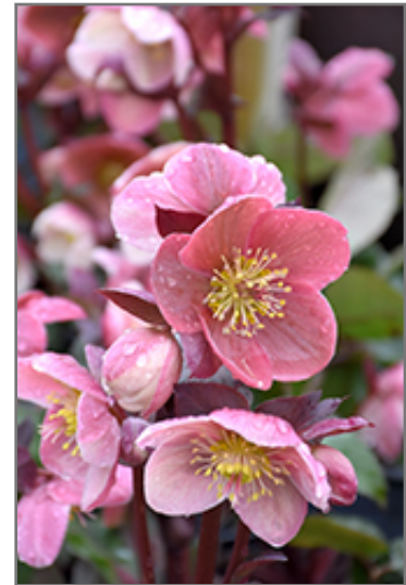
Pink Frost Hellebore flowers

Pink Frost Hellebore is recommended for the following landscape applications;