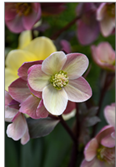
Pink Frost Hellebore flowers