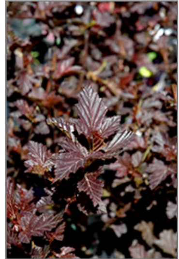
Gumdrop Burgundy Candy Ninebark foliage