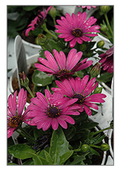
Soprano Purple African Daisy flowers