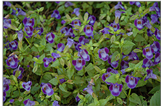
Wishbone Flower flowers