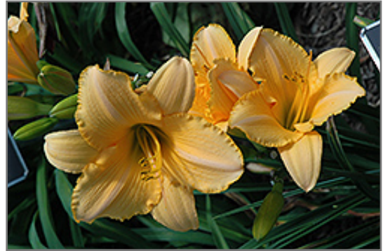
Ballet Belle Daylily flowers