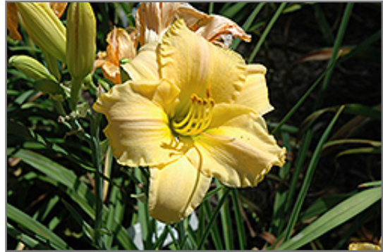
China Calm Daylily flowers