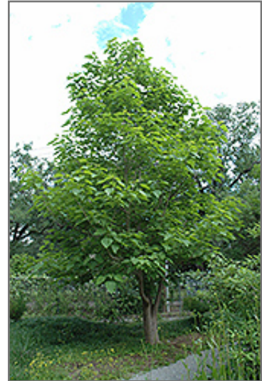
Southern Catalpa

Southern Catalpa is recommended for the following landscape applications;