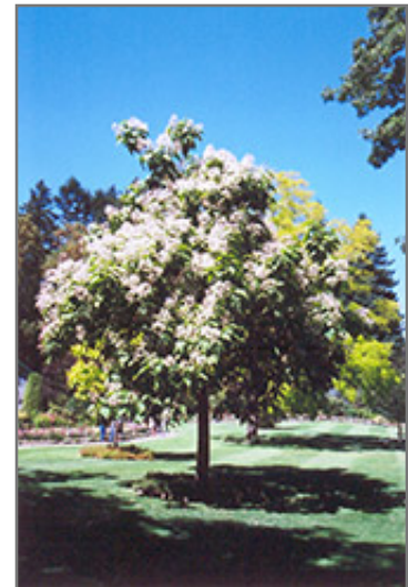
Southern Catalpa in bloom