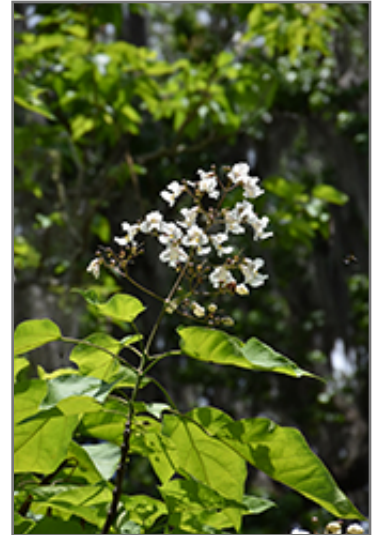
Southern Catalpa flowers

This tree does best in full sun to partial shade. It is an amazingly adaptable plant, tolerating both dry conditions and even some standing water. It is considered to be drought-tolerant, and thus makes an ideal choice for xeriscaping or the moisture-conserving landscape. It is not particular as to soil type or pH, and is able to handle environmental salt. It is highly tolerant of urban pollution and will even thrive in inner city environments. This species is native to parts of North America.