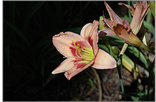
Master Magician Daylily flowers