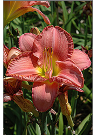
Scottish Fantasy Daylily flowers