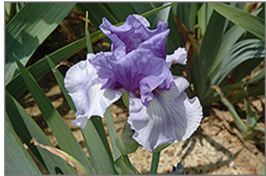
Poet's Rhyme Iris flowers