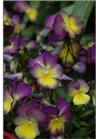
Celestial Starry Night Pansy flowers

Celestial Starry Night Pansy is recommended for the following landscape applications;