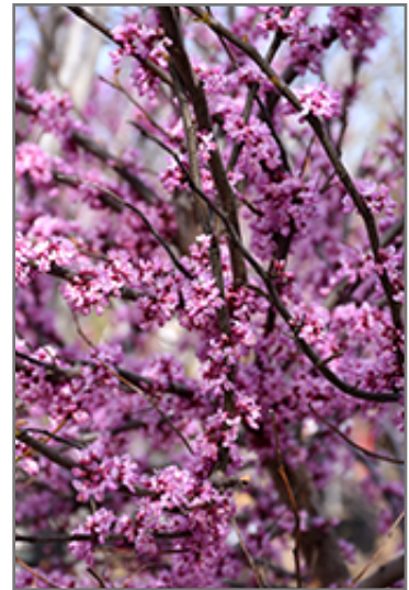
Ace Of Hearts Redbud flowers