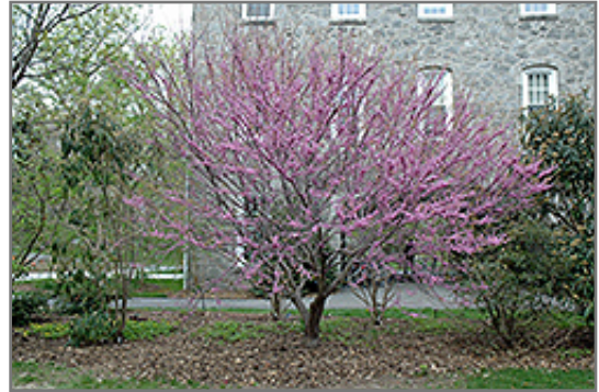
Ace Of Hearts Redbud in bloom

Ace Of Hearts Redbud is recommended for the following landscape applications;