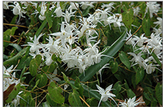
Milky Way Bishop's Hat flowers

Milky Way Bishop's Hat is recommended for the following landscape applications;