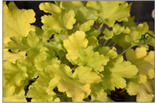
Lime Marmalade Coral Bells foliage

Lime Marmalade Coral Bells will grow to be about 16 inches tall at maturity extending to 30 inches tall with the flowers, with a spread of 18 inches. When grown in masses or used as a bedding plant, individual plants should be spaced approximately 15 inches apart. Its foliage tends to remain dense right to the ground, not requiring facer plants in front. It grows at a medium rate, and under ideal conditions can be expected to live for approximately 10 years. As an evergreen perennial, this plant will typically keep its form and foliage year-round.