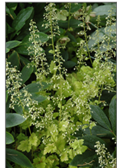
Lime Marmalade Coral Bells flowers