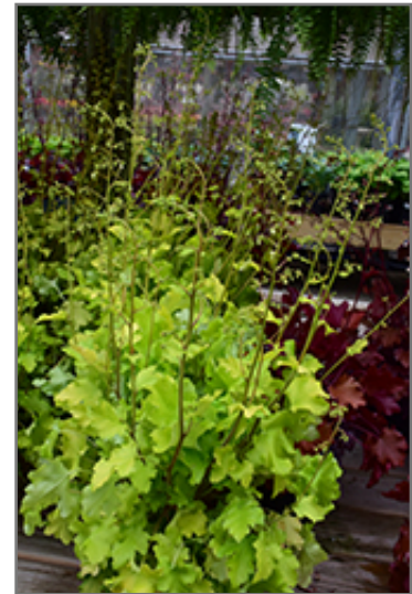
Lime Marmalade Coral Bells in bloom

Lime Marmalade Coral Bells is recommended for the following landscape applications;