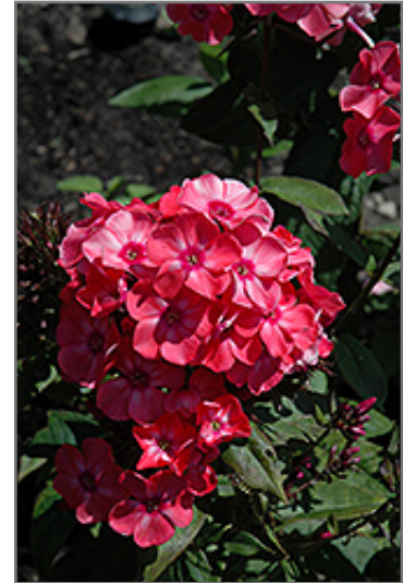
Garden Girls Glamour Girl Garden Phlox flowers

Garden Girls Glamour Girl Garden Phlox is recommended for the following landscape applications;