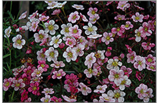
Highlander Rose Shades Saxifrage flowers