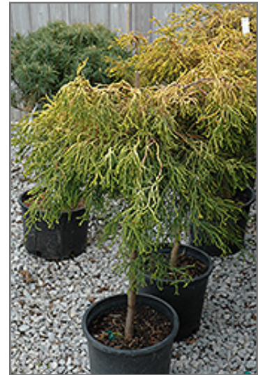
Lemon Twist Hinoki Falsecypress (tree form)

Lemon Twist Hinoki Falsecypress (tree form) will grow to be about 4 feet tall at maturity, with a spread of 3 feet. It has a low canopy with a typical clearance of 3 feet from the ground. It grows at a slow rate, and under ideal conditions can be expected to live for 70 years or more.