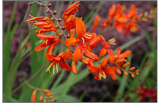
Bright Eyes Crocosmia flowers

Bright Eyes Crocosmia is recommended for the following landscape applications;