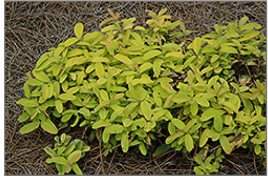
Brigadoon St. John's Wort