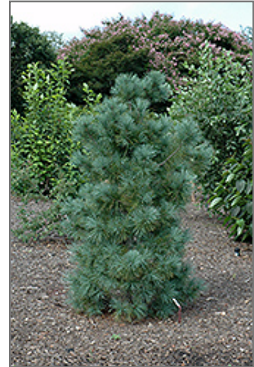
Domingo Limber Pine