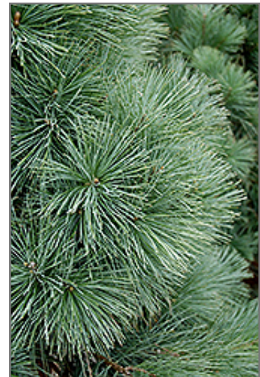
Domingo Limber Pine foliage