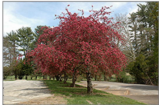
Purple Flowering Crab in bloom