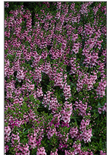
Serenita Pink Angelonia in bloom