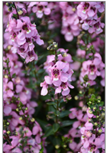
Serenita Pink Angelonia flowers