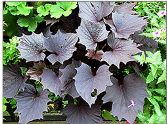
Sweet Caroline Bewitched Purple Sweet Potato Vine foliage

Sweet Caroline Bewitched Purple Sweet Potato Vine will grow to be about 8 inches tall at maturity, with a spread of 24 inches. Its foliage tends to remain low and dense right to the ground. This fast-growing annual will normally live for one full growing season, needing replacement the following year.