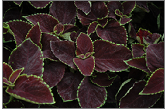
Premium Sun Chocolate Mint Coleus foliage