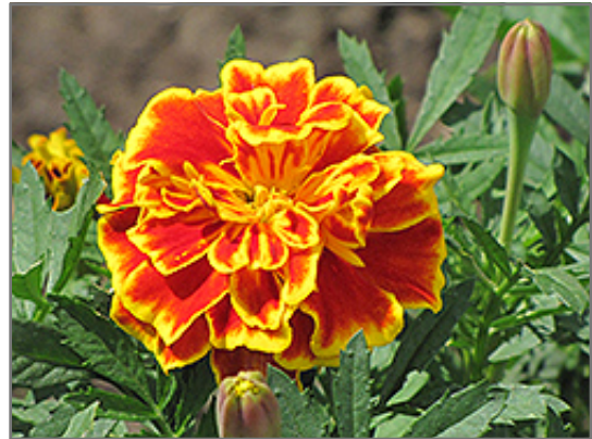
Safari Scarlet Marigold flowers