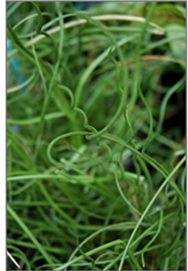
Spiralis Corkscrew Rush foliage