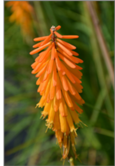
Mango Popsicle Torchlily flowers

Mango Popsicle Torchlily is recommended for the following landscape applications;