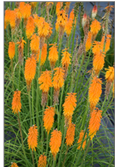
Mango Popsicle Torchlily in bloom