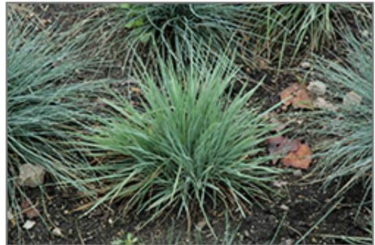
Coolio June Grass