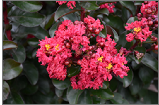
Cherry Mocha Crapemyrtle flowers

Cherry Mocha Crapemyrtle is recommended for the following landscape applications;