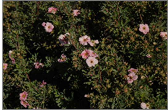
Happy Face Pink Paradise Potentilla flowers