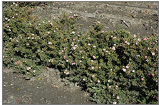
Happy Face Pink Paradise Potentilla in bloom