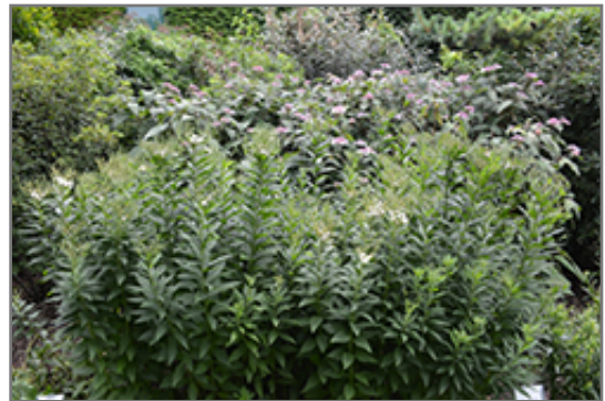
White Lightning Ironweed flowers