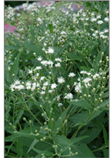
White Lightning Ironweed flowers

White Lightning Ironweed is recommended for the following landscape applications;