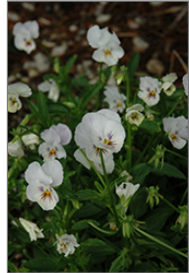
Painted Porcelain Pansy flowers

A lovely variety presenting elegant porcelain white blooms with lavender infused upper petals, and deep purple markings in the centers; creates visually captivating containers, or border edgings