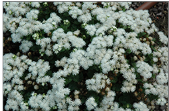
Cloud Nine White Flossflower flowers