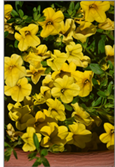
Kabloom Yellow Calibrachoa flowers