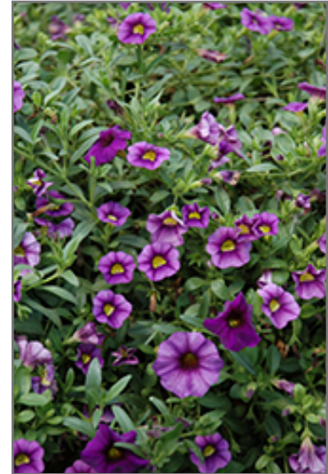
Noa Violet Calibrachoa flowers