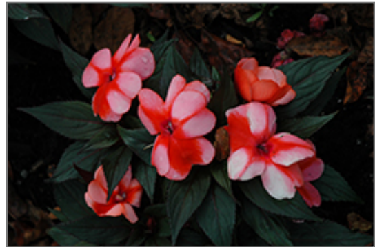
Petticoat Mandarin Star New Guinea Impatiens flowers