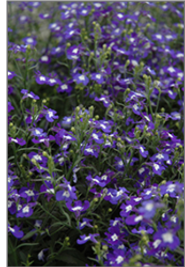
Hot Blue With Eye Lobelia flowers