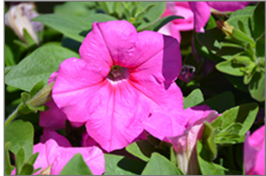
Easy Wave Pink Passion Petunia flowers

Easy Wave Pink Passion Petunia is recommended for the following landscape applications;