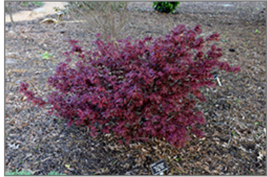
Hime Shoji Japanese Maple

Hime Shoji Japanese Maple will grow to be about 6 feet tall at maturity, with a spread of 6 feet. It tends to be a little leggy, with a typical clearance of 1 foot from the ground, and is suitable for planting under power lines. It grows at a slow rate, and under ideal conditions can be expected to live for 60 years or more.