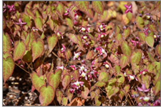
Bishop's Hat in bloom

Bishop's Hat will grow to be about 12 inches tall at maturity, with a spread of 18 inches. When grown in masses or used as a bedding plant, individual plants should be spaced approximately 15 inches apart. Its foliage tends to remain dense right to the ground, not requiring facer plants in front. It grows at a medium rate, and under ideal conditions can be expected to live for approximately 10 years.