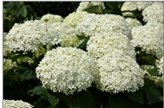
Invincibelle Limetta Hydrangea flowers