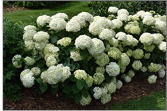
Invincibelle Limetta Hydrangea in bloom